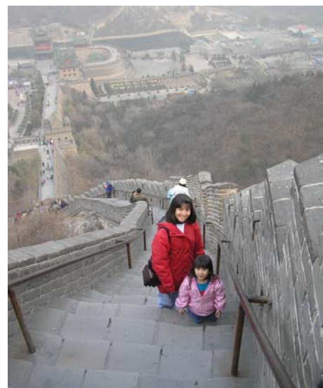
A View from the Top of the Great Wall

out the enemy? If not you, than who? I am amazed at how many of my Christian brothers and sisters in Christ build up their spiritual wall