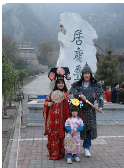
The Gerig Dynasty!

The picture I want you to have in your mind is one found in Nehemiah 4. As the Israelites worked feverishly to finish the (Continued on page 5.)